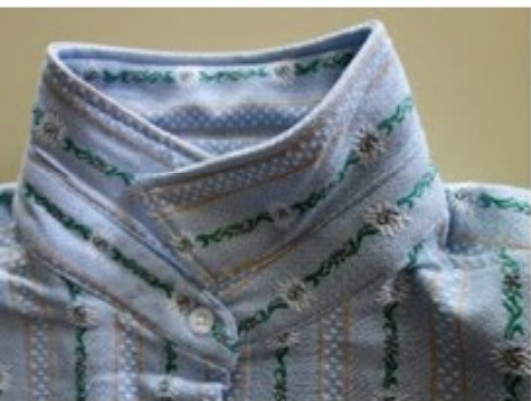
detail of collar